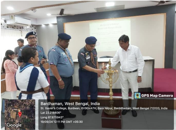
Lamp Lighting Ceremony