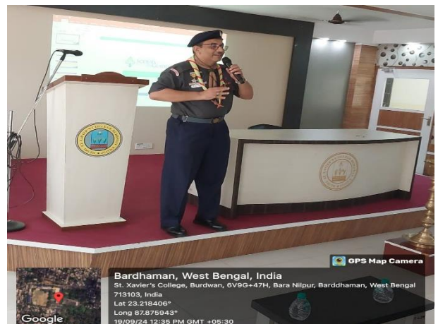
Resource Person's Delebaration