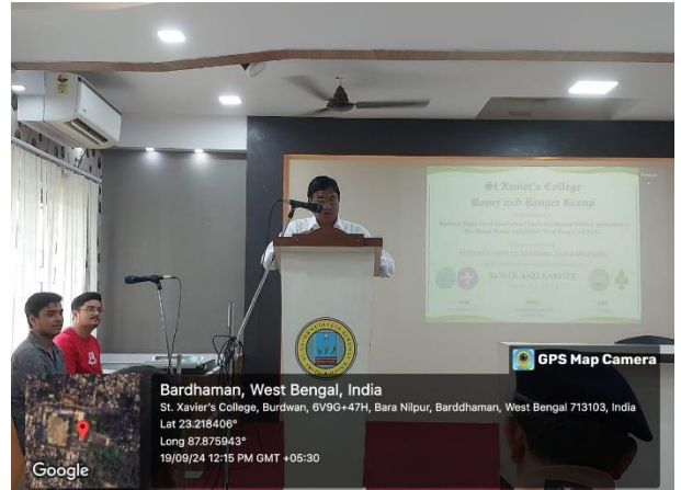
Father Principal's Address