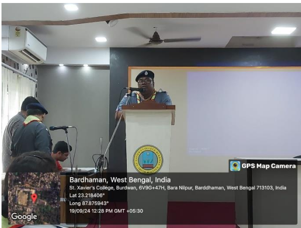
Resource Person's Delebaration