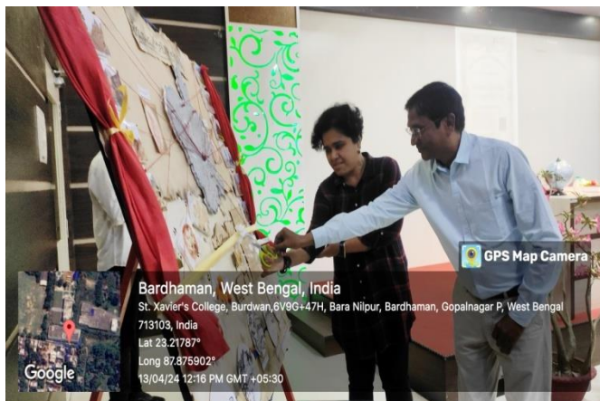
Fig 3 : Inaugurating Departmental Wall Magazine