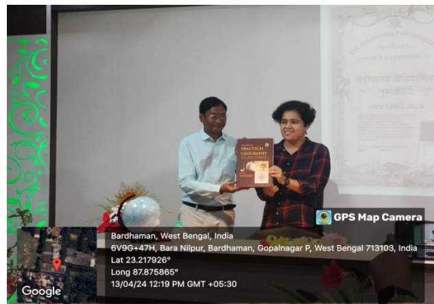
Fig 4 : Inaugurating Departmental Practical Laboratory Manual Book