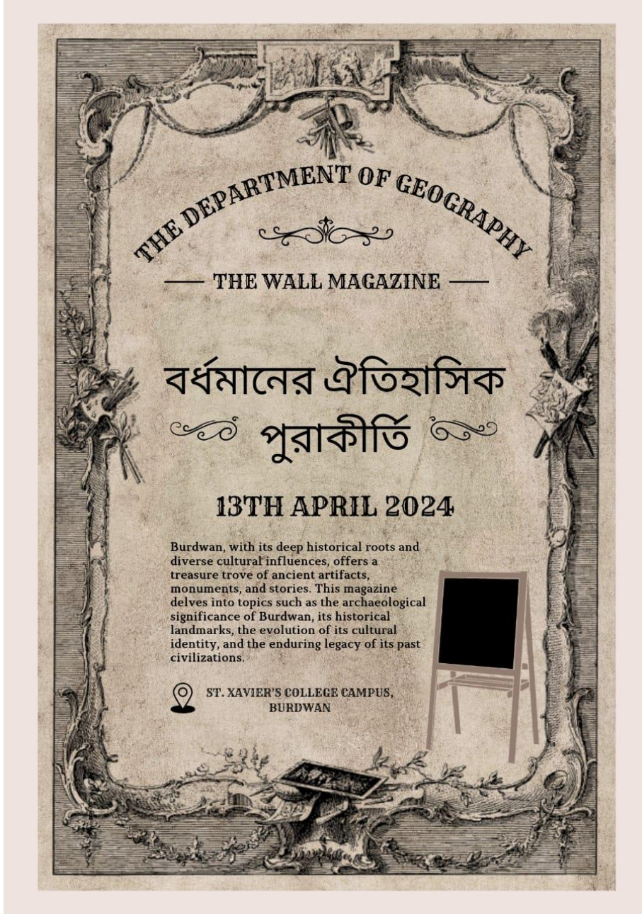
Flyer: Wall Magazine of the Department of Geography