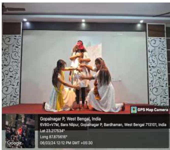
Fig 2: The students performing the dance drama.