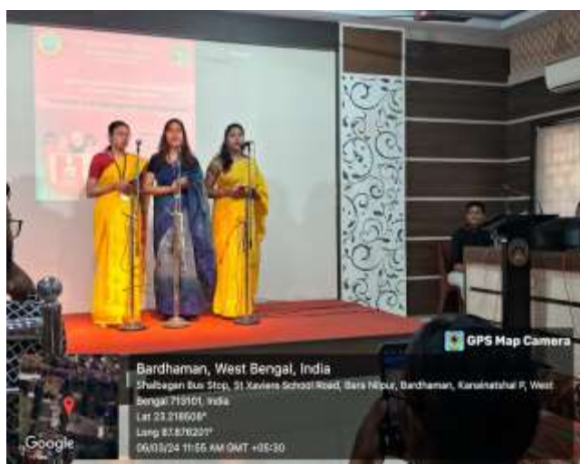
Fig 4: The performance of the first-semester students.