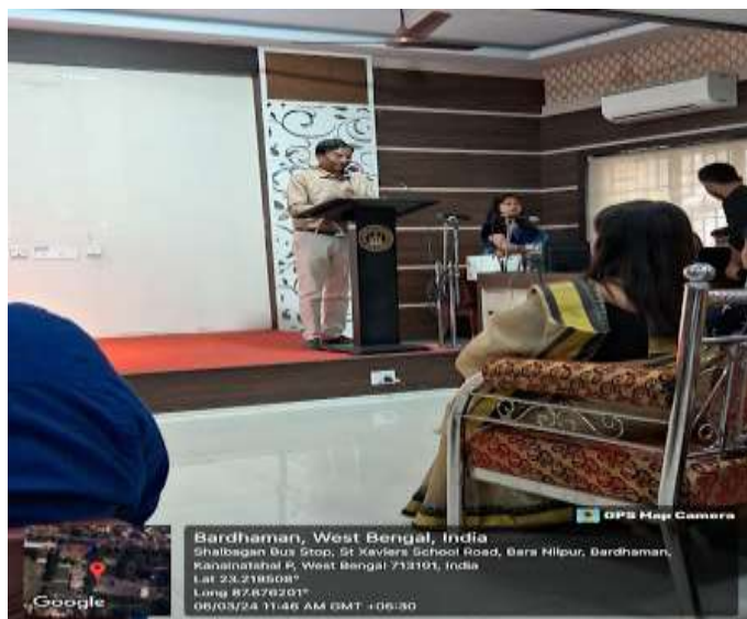
Fig 1: Father Principal delivering his speech.