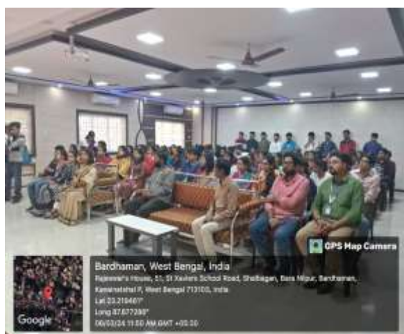
Fig 3: The students, and the faculty members of various departments during the program.