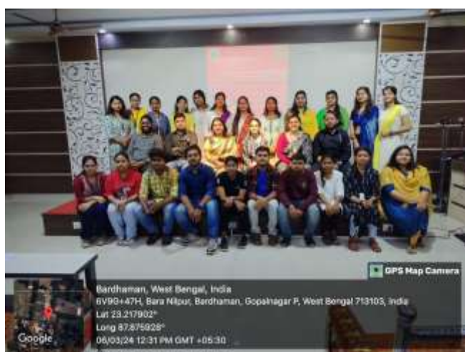
Fig 5: The students of the Sociology Department with the faculty members.