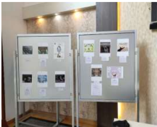
Fig 6: Elder Abuse Awareness Day Posters exhibited in the reception area of SXC-B to bring awareness among all the students.