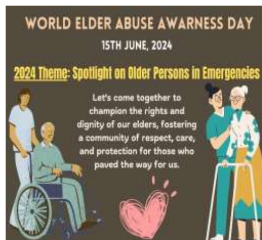
Fig 1, Fig 2, Fig 3, Fig 4, Fig 5: The digital Posters by the students.