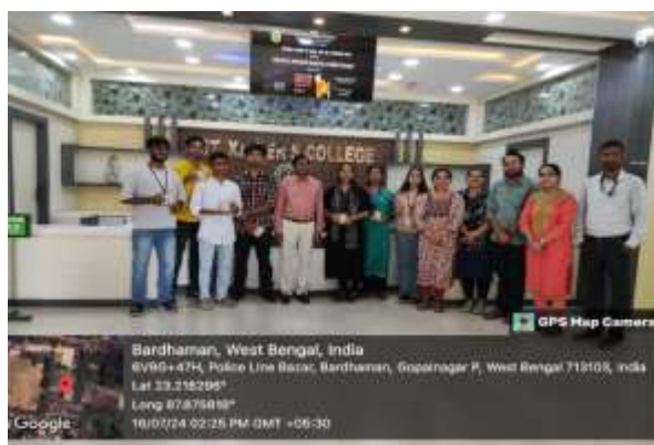
Fig 8: Father Principal with all the participants and the faculty members of the organizing Department.