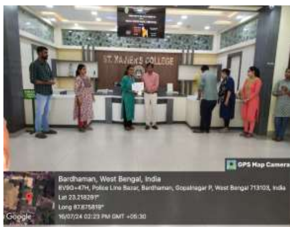
Fig 7: Father Principal handing over the certificate to one of the participants.